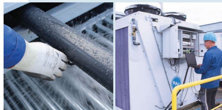
Preventive maintenance and skilled repairs

All for the most cost effective and most reliable operation of your equipment.