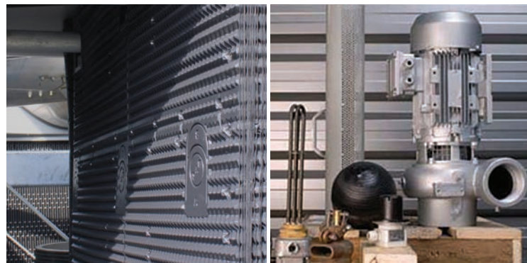
Original spare parts and fill

Using BAC original parts, ensures a first time fit and offers full traceability of your equipment history.