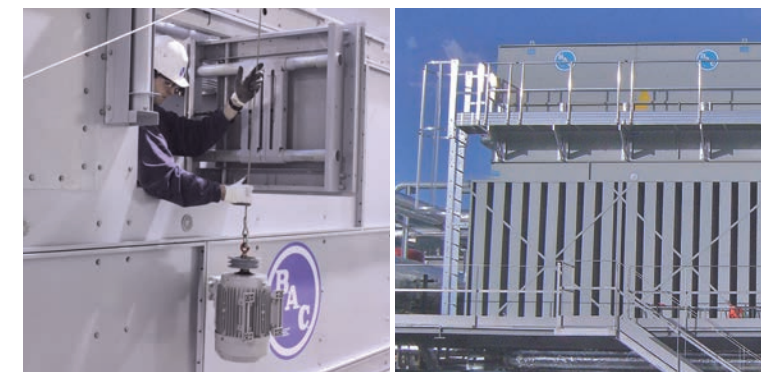
Upgrades and new technologies

These upgrades are essential to improve your equipment's efficiency and comply with any new regulations .